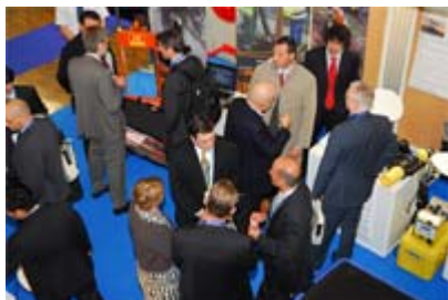
Many delegates were interested in the exhibition during the IGRC2008 in Paris

At the IGRC2008, the exhibition of gas related innovations was introduced for the first time. It proved to be a great success. More than 40 innovations were displayed. The organisers of the IGRC2011 have decided to continue this initiative.